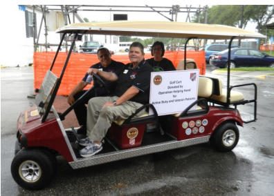
The golf carts we donated to JAH?

OUR COALITION OFFICERS FROM FOREIGN NATIONS ATTEND EVERY LUNCHEON AS OUR INVITED GUESTS?