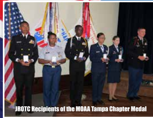
JROTC Recipients of the MOAA Tampa Chapter Medal