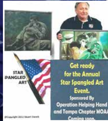
Star Spangled Art

The Tampa chapter engages in fund raising events, such as the Annual Bob Silah Memorial Golf Tournament and the Star Spangled Art Show, to support charitable activities including Operation Helping Hand (Op HH) and the Chapter Scholarship Program.