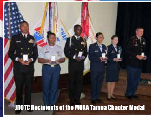
JROTC Recipients of the MOAA Tampa Chapter Medal