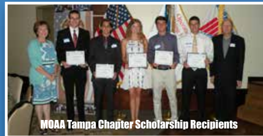
MOAA Tampa Chapter Scholarship Recipients

The Tampa chapter engages in fund raising events, such as the Annual Bob Silah Memorial Golf Tournament and the Star Spangled Art Show, to support charitable activities including Operation Helping Hand (Op HH) and the Chapter Scholarship Program.