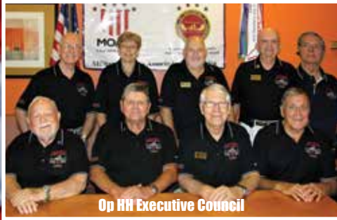
Op HH Executive Council