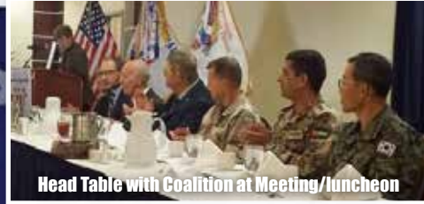
Head Table with Coalition at Meeting/Luncheon

A special feature of each luncheon is to recognize officers from the Coalition (the foreign nations supporting the US in the Global War on Terror).